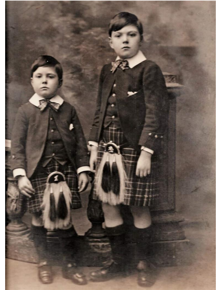
Nobby & Tubby of the Forester's Arms ~1914

High Street, Lasswade, Bonnyrigg, near Loanhead, Midlothian